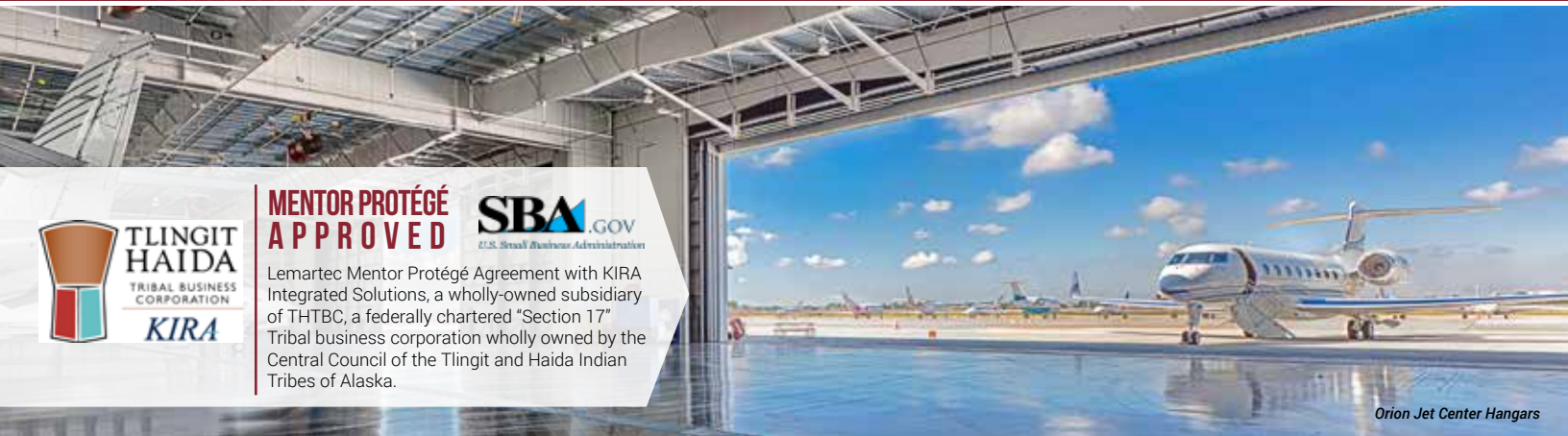
Orion Jet Center Hangars